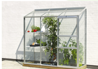
Ida 1300 with horticultural glass