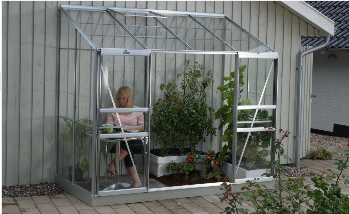
Ida 3300 with horticultural glass