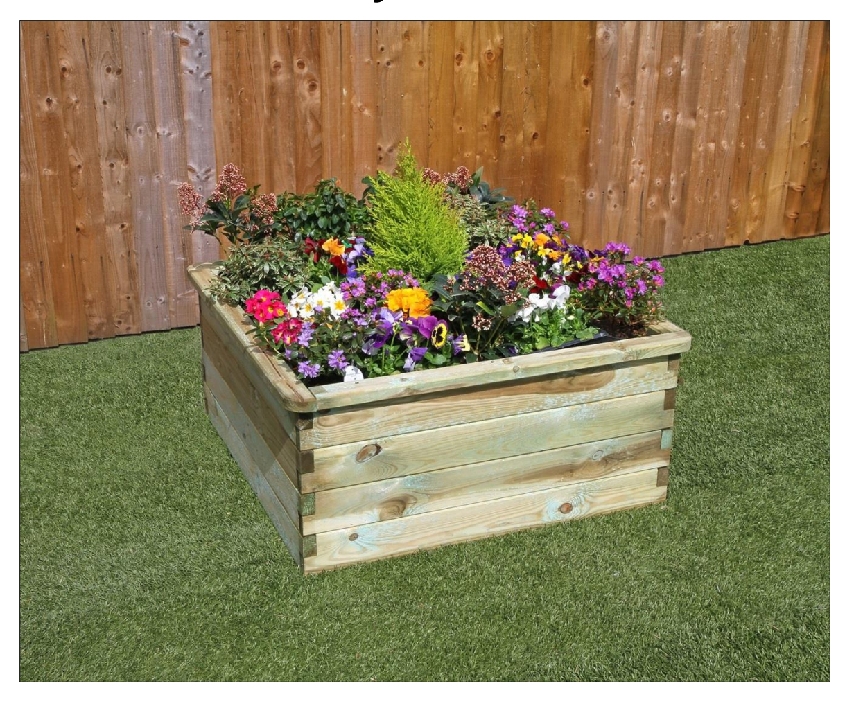
(W x D x H) 0.90m x 0.90m x 0.45m Product Name: Sleeper Raised Bed

Pressure Treated products should not be treated with any other products for the first month.