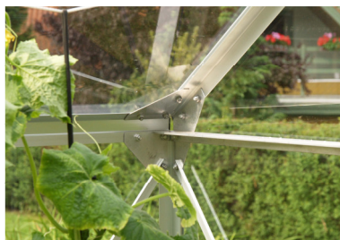
Strong corner plates and supports