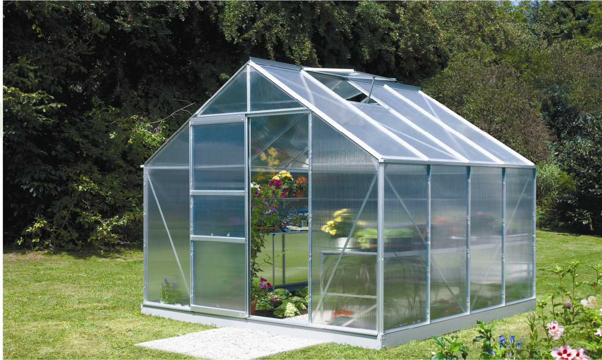
Neptune (Merkur) 6700 with 6mm polycarbonate