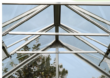
Strong braces at the roof and eaves