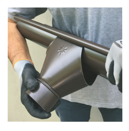
The drain spout is external and it is snap-fitted with a quick movement, with no need of tools, screws or rivets.