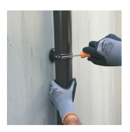
Besides the gutter, we supply you with the equipment needed for rainwater drainage: downspout, elbows, collars.