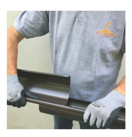
An amazing easy system to join two gutters; without junction sleeves, with no screws and no rivets.