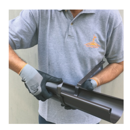
The MONTAFACILE gutter shank is made of hot galvanized and powder-painted sheet. It is therefore high quality and capable of supporting the gutter in any situation and over many years. The gutter is firmly fastened to the support by simply folding two metal tabs by hand.