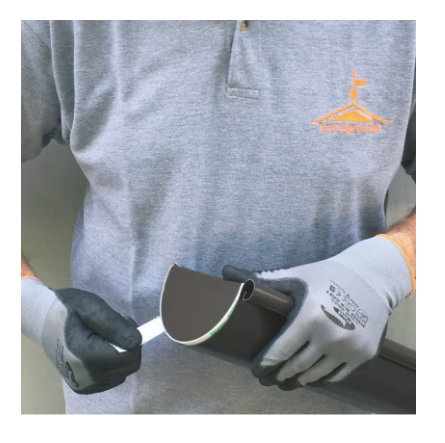
A special silicone adhesive band is already applied to the end-cap, in this way it is strongly connected to the gutter and ensures excellent sealing from the very beginning.