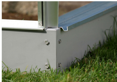
Optional greenhouse base