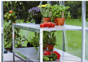
Optional 2-tier staging