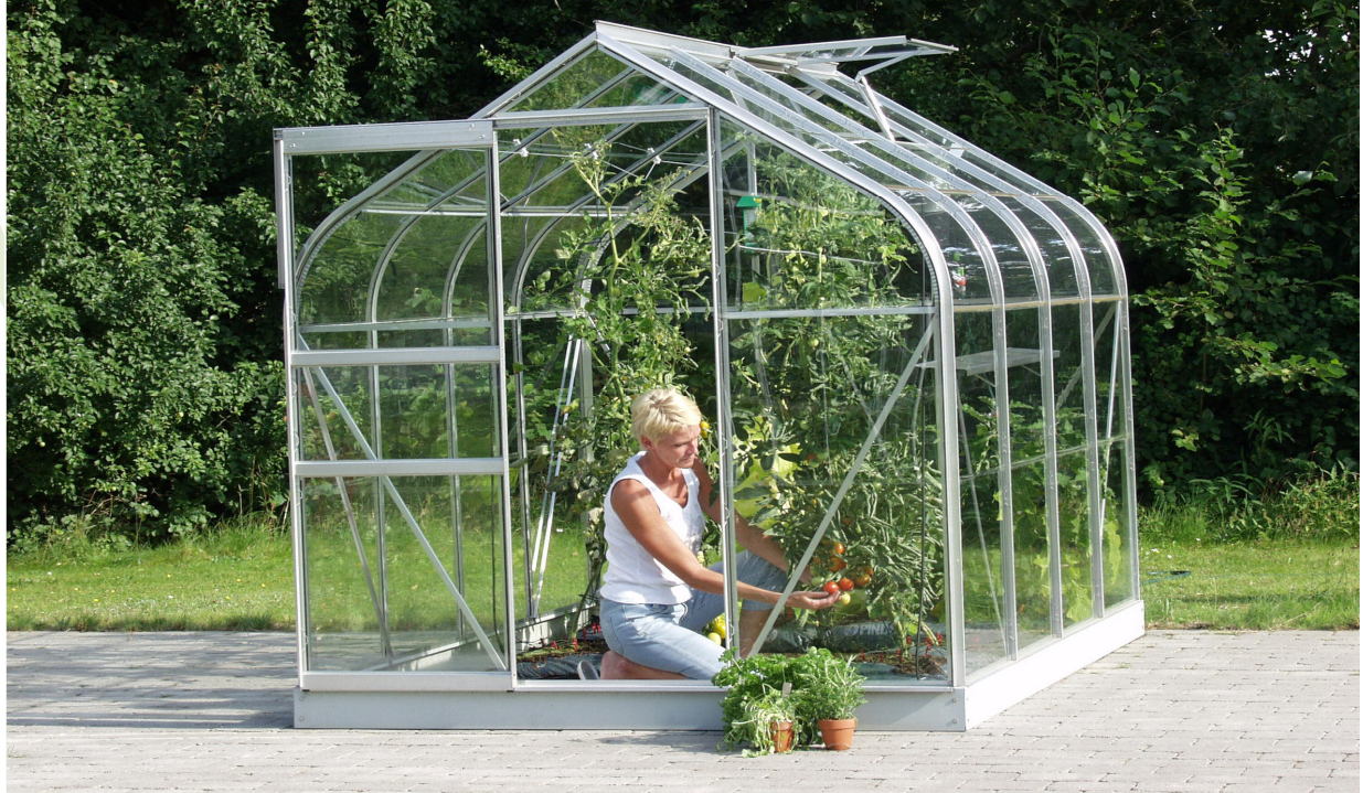
Orion 5000 with horticultural glass