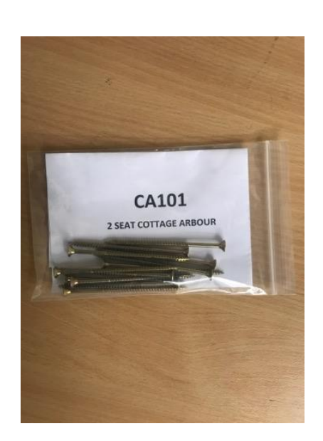
Part 6 Product instructions and screw pack 12 screws all the same size will be need for this assembly: