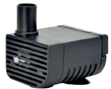
3. Feature Pump

Please read before unpacking your Water Feature, check all parts are removed from packaging before discarding. If any parts are missing or if your water feature is damaged, please contact your stockist as soon as possible.