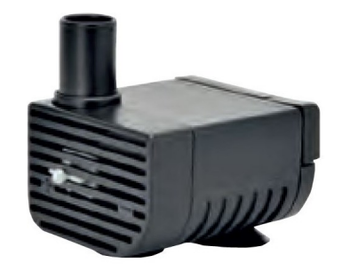
3. Feature Pump

Please read before unpacking your Water Feature, check all parts are removed from packaging before discarding. If any parts are missing or if your water feature is damaged, please contact your stockist as soon as possible.