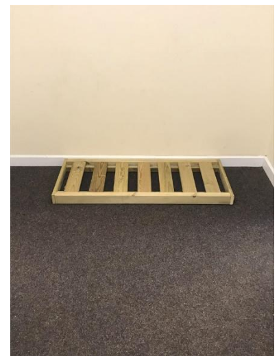
Part 5 Roof Panel