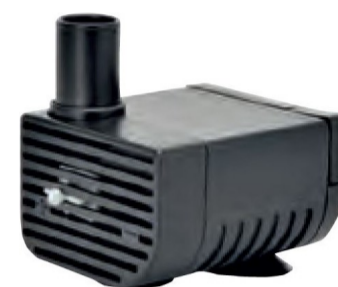
3. Feature Pump

Please read before unpacking your Water Feature, check all parts are removed from packaging before discarding. If any parts are missing or if your water feature is damaged, please contact your stockist as soon as possible.